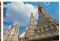
Wat Arun Temple