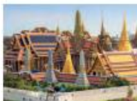
The Grand Place

Make the most of your trip to Thailand. These are some of the must see attractions that you can discover during your visit.