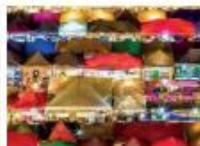
Train Night Market